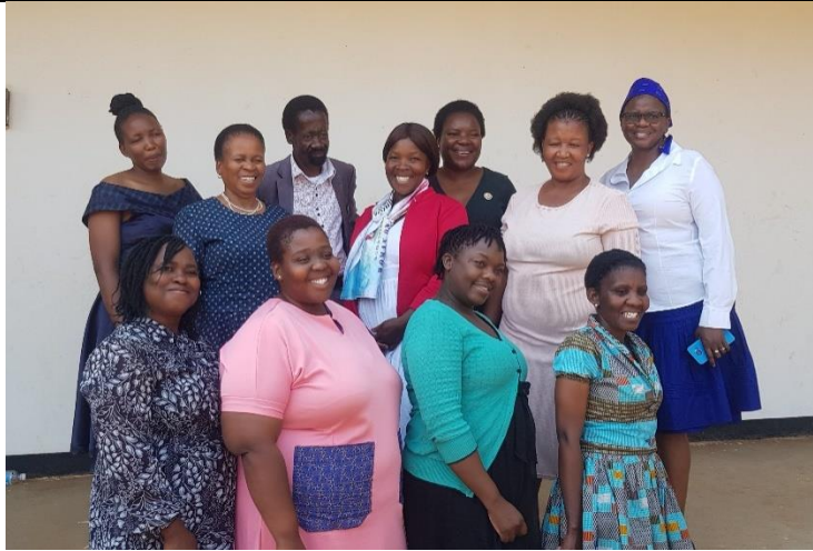
Trainee trainers with Bord chairperson at Ark and Mark and Head of Family Welfare Division from DSP

Local authorities (Councils) continue to show much interest in implementing ICDP in their communities. Molepolole (Kweneng District) would like to sponsor more facilitators outside DSP funding to be trained for implementation in their respective area of coverage.