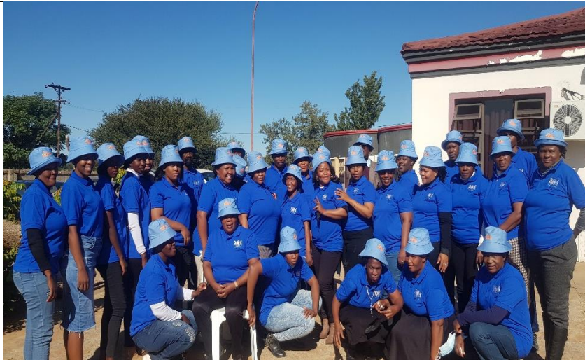
Facilitators in Gabane village

Trainee facilitators in the 2 new villages included social workers, pastors, ward headmen, teachers, various community committee members, police officers (gender affairs unit), parents and a foster parent.