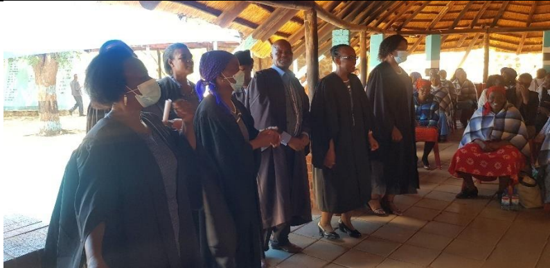
One of the parents' groups giving testimony of their ICDP experience