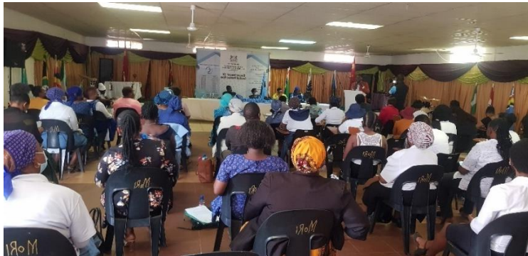
Graduation in Ramotswa

The programme was implemented in the 4 villages of Ramotswa, Gabane, Molepolole and Thamaga. Thamaga has been implementing ICDP since 2017. Implementation ran from March–November 2022. There were challenges experienced during the implementation which included;