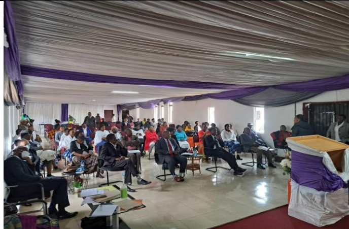
ICDP Graduation in Thamaga