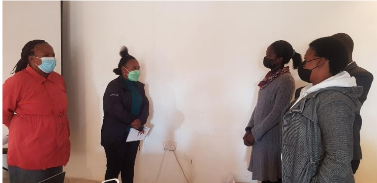
Role by trainee facilitators during training

appreciate her own pain and possibly that of her father, and was able to reach out to him. He was appreciative of the gesture and bitterly regretted all the hurt he caused, something she never thought could happen. She has since taken the initiative to care for his welfare as he is sickly and old. She witnessed positive changes in the way she related and treated her family, and this has brought great joy and unity in the family. She attributed all the positive changes to ICDP and was glad she allowed herself to enrol as a facilitator and was ready to impact other families in the community.