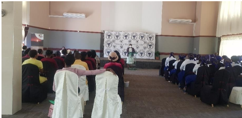
Facilitators and parents during graduation in Molepolole

their children. One single parent, who is a teacher by profession, also a pastor and a mentor shared that, "I feel had I interacted with ICDP earlier, I would not have lost my 26 year old son to suicide. I had high expectations of him and his 21 year old younger sister, because I am an honourable and respectable woman in society, and I expected them to live as per my standards. ICDP has worked for me, as I learnt to appreciate that children are not objects, that they have their own interests, thoughts and ways of looking at life. I am now implementing ICDP in my relation to my daughter and as a result we now have a positive relationship."