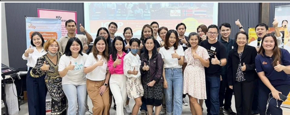
Above: KF Bangkok school sharing ICDP with parents of students.