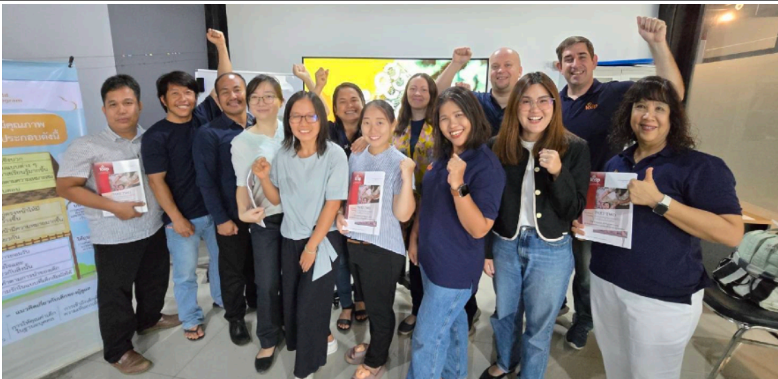
Training new facilitators from a number of different ministries, foundations, and local NGO's.