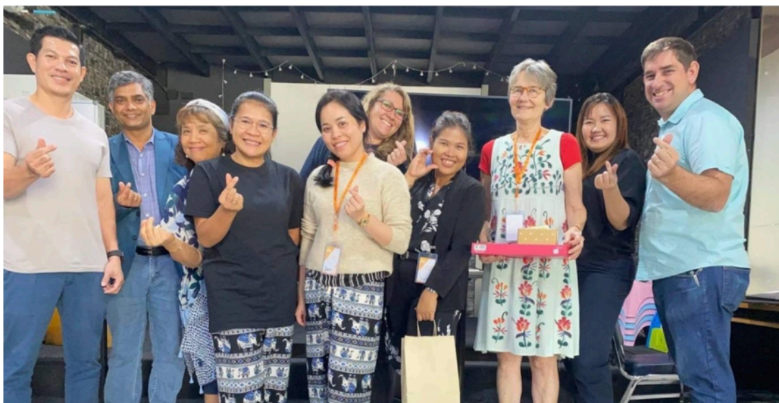
Our first team of Trainers of Facilitators!

In pairs, our facilitators in training are running approximately thirteen caregiver groups. We are excited to see ways the ICDP program continues to connect parents, teachers, and social workers with children while impacting our communities for the better. Some of our more notable caregiver groups this year included a large pre-school located in downtown Chiang Mai. They required over 20 of their teachers to participate in our trainings and offered great feedback. Additionally, KF Bangkok School opened its doors in August, and under an MOU with ICDP Thailand, was proud to have all of their staff ICDP certified. They have committed to ongoing partnerships for their staff, teachers, and parents so that all their students may be learning in a nurturing and caring environment with a multifaceted approach.