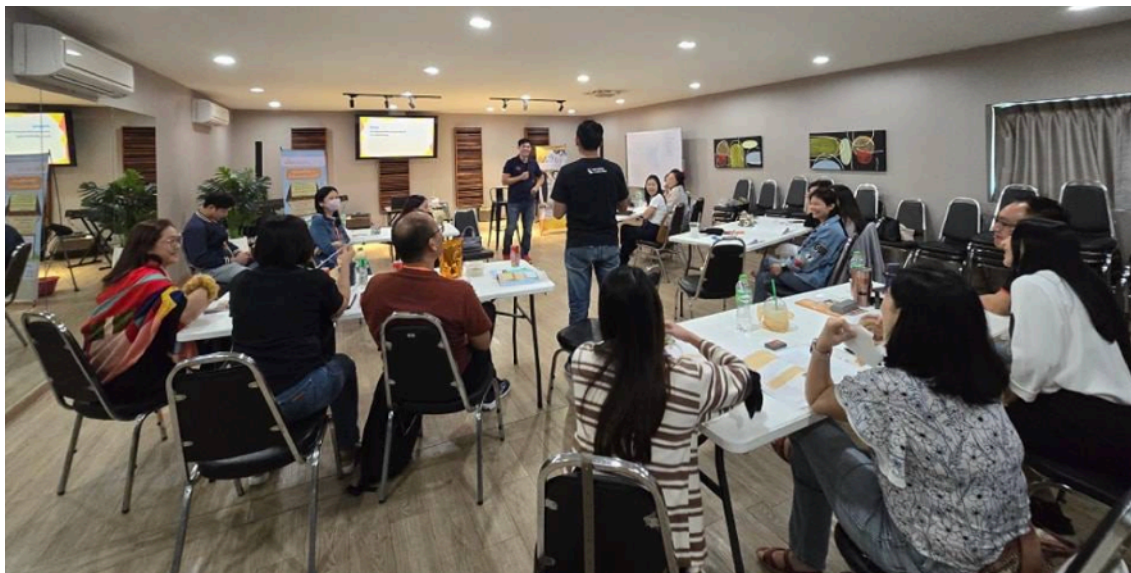
Above: First training of facilitators hosted in Bangkok