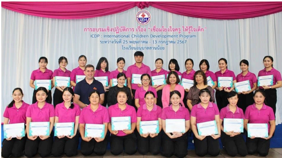
Above: Awarding the teachers at โรงเรียนอนุบาลสวนน้อย (Suan Nooi Pre-School) in Chiang Mai