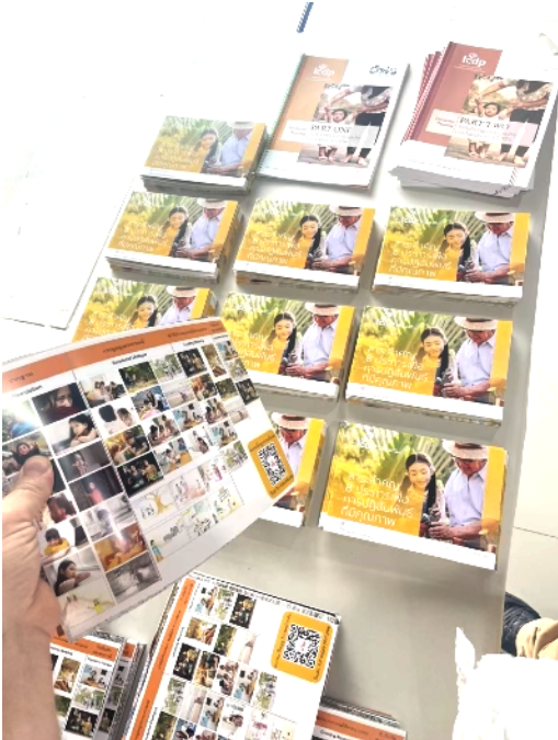
Left: Preparing newly translated and printed for facilitators to use in future groups Above: Staff of KF Bangkok after completing ICDP trainings