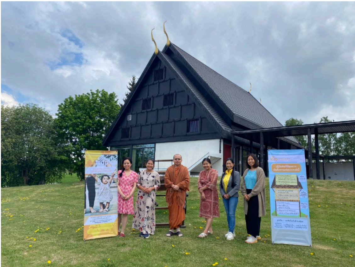
Facilitator training in Thai language, in the country of Norway, hosted a local Buddhist temple