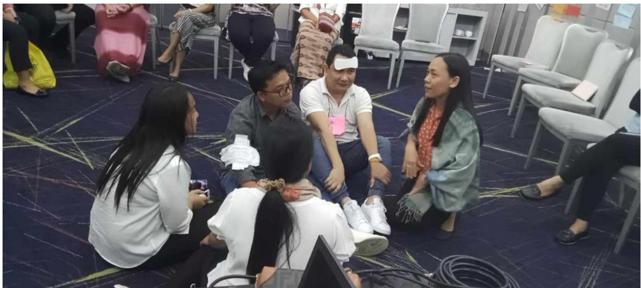
Role play on Comprehension Dialogue