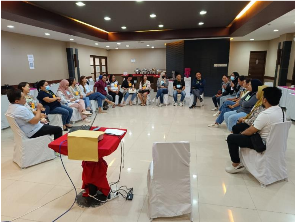
Sharing of insights and reflections on the previous day's discussions.