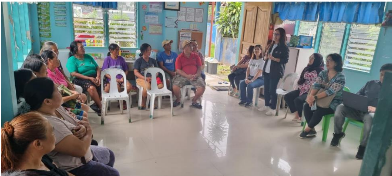
RPCs witnessed the parenting session in the community.