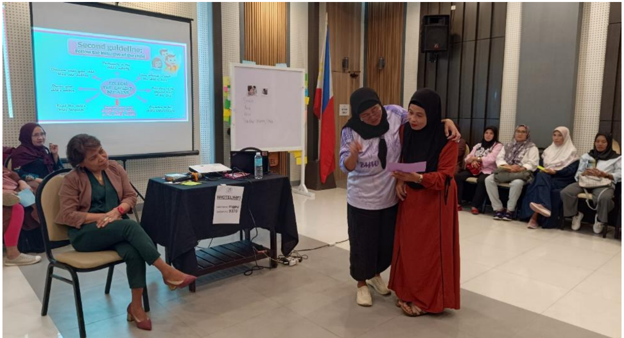
Role play on ICDP Guideline 2: Follow the child's initiative