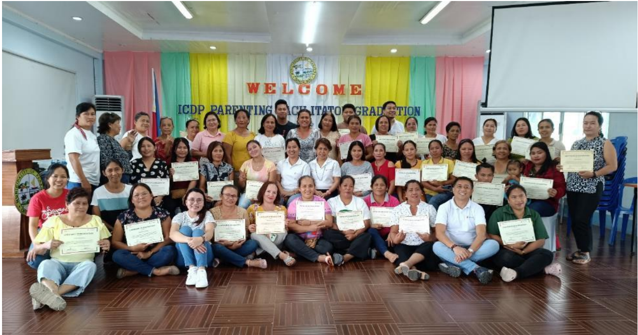
The newly certified ICDP Facilitators in Samar