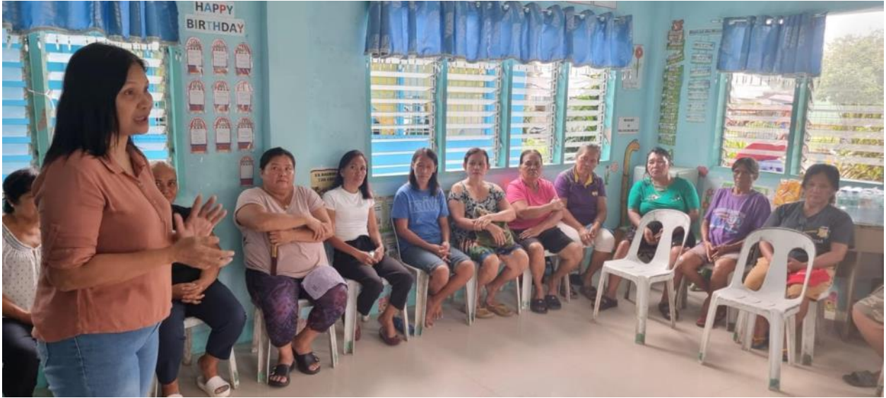
Parent leader facilitating the session on Empathy during the RPCs' field visit in the community.