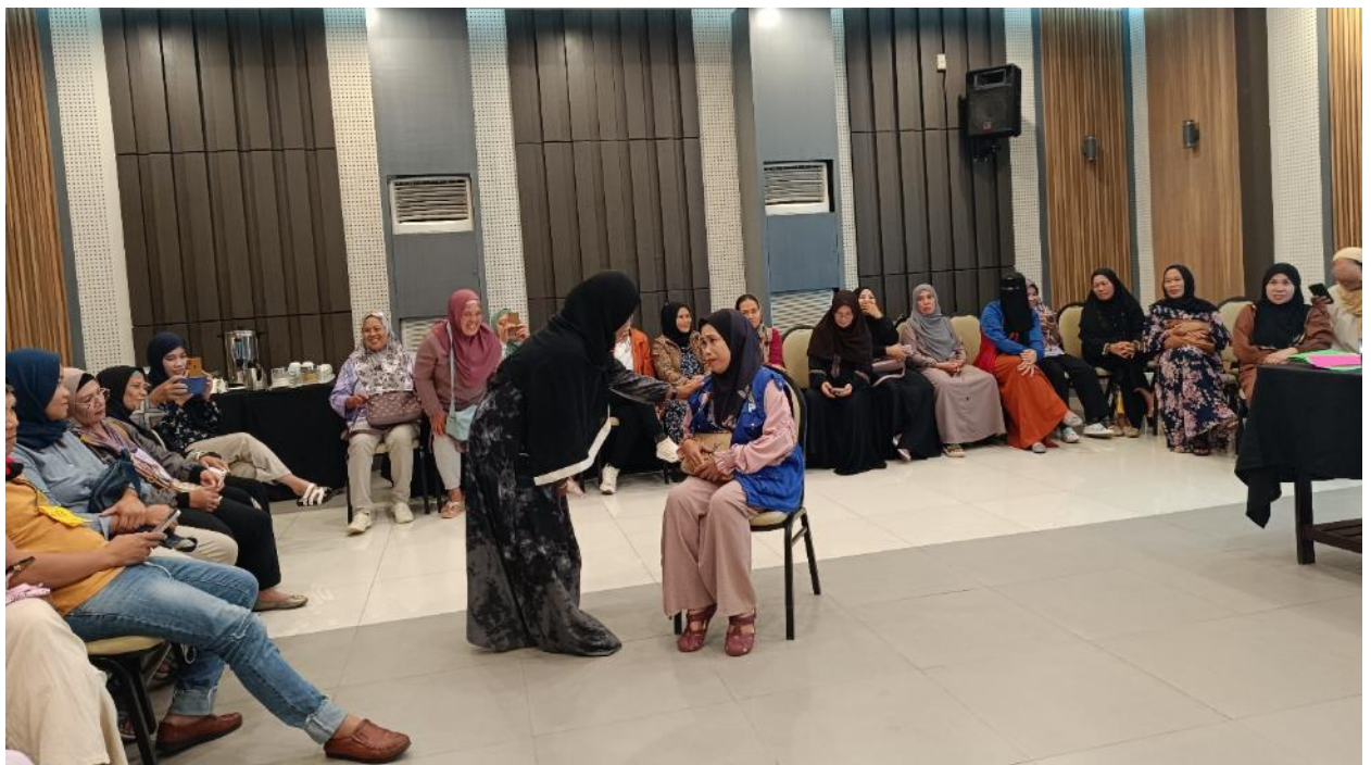
Role play on ICDP Guideline 3: Close communication