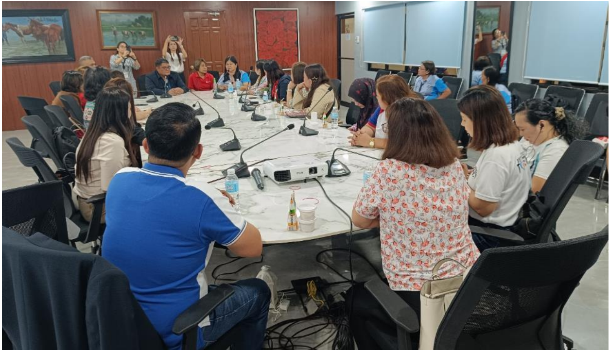
Ormoc City Councilor and CSWDO (City Social Welfare and Development Office) Staff with the RPCs during the sharing on how they implemented ICDP in their city.