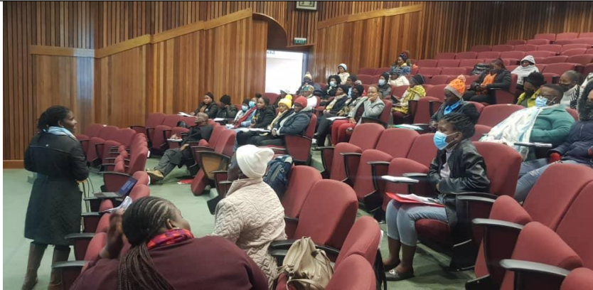
Facilitators listening attentively to a presentation.