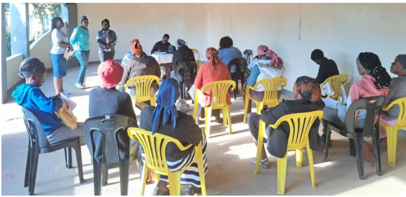
Thamaga also showed up during the supervision meetings to breakdown their implementation insights