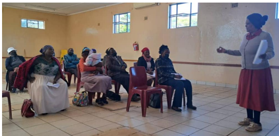
Ramotswa facilitator as she shared some of the success stories and challenges faced in her group