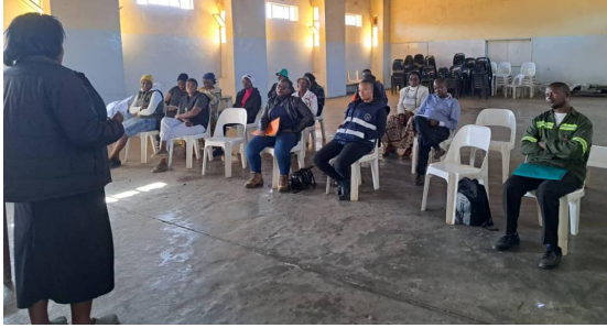
Gabane facilitators as they were attentive to the report being shared by one of them