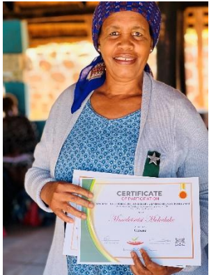
Some of the parents in Ramotswa as they celebrated their graduation. Putting on traditional celebratory attires.