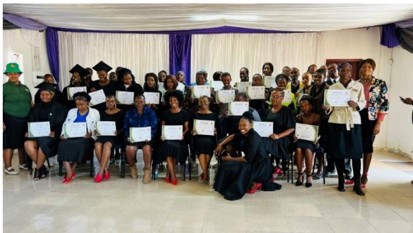
A group of parents in Thamaga as they celebrated their achievement of completing ICDP program during their graduation