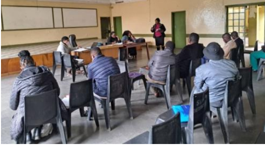
Molepolole also met and carried out their supervision meeting