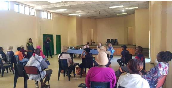
Lobatse facilitators supervision meeting as one of the groups shared their experiences