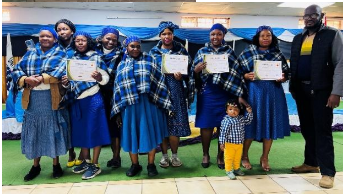
Some of the parents in Ramotswa as they celebrated their graduation. Putting on traditional celebratory attires.