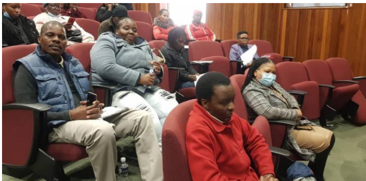
The S&CD personnel with Assistant District Commissioner as part of audience.

facilitators to implement the ICDP in their community.