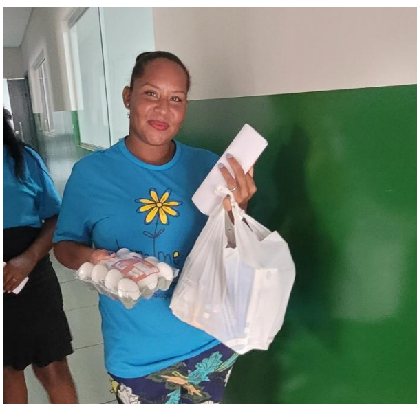
Mother receiving the Interactive Kit.