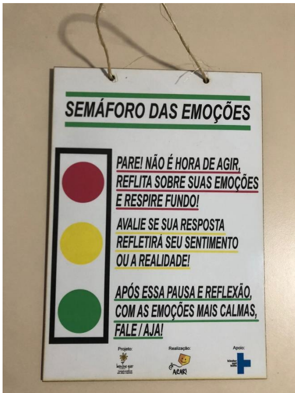
Emotion traffic light: tool used in workshops to reflect on one's own emotions before the mother/father interacts with the child.