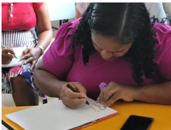
Mother participating in Bem Me Quer project meetings