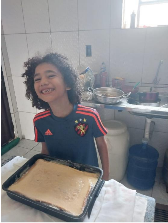
Child using the interactive kit at home.