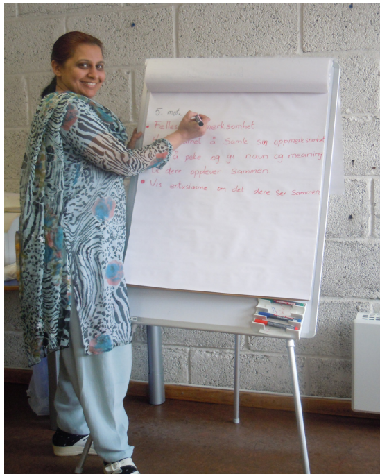
Picture 1 and 2: Facilitators in the minority version of the ICDP teaching and role playing